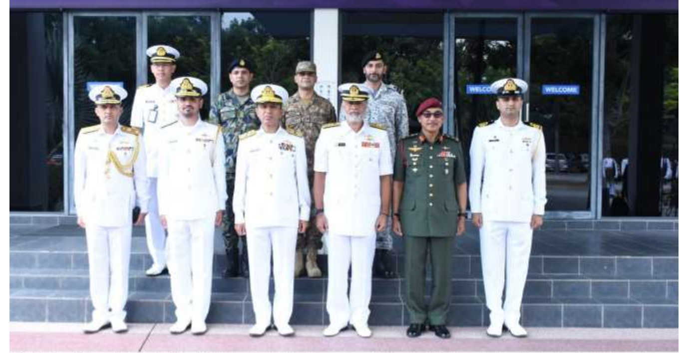
Chief of the Naval Staff, Admiral Muhammad Amjad Khan Niazi visited Malaysian National Defence College PUSPAHANAS during official visit to Malaysia