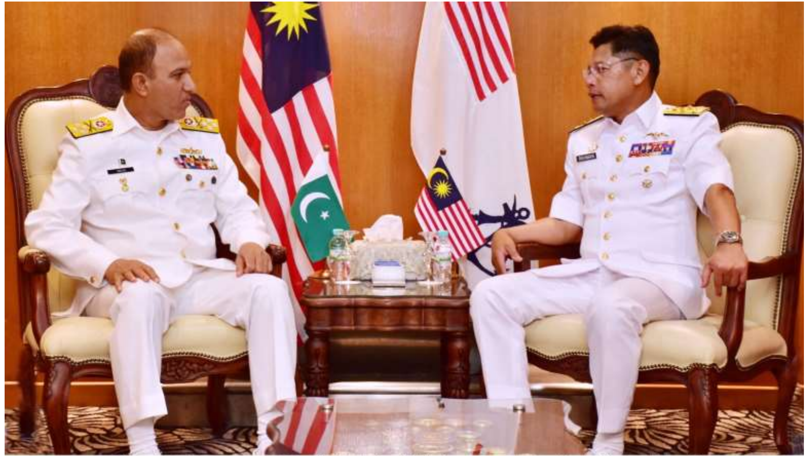
Chief of the Naval Staff, Admiral Muhammad Amjad Khan Niazi exchanging views with Chief of Royal Malaysian Navy during official visit to Malaysia